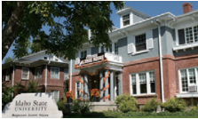
Idaho State University