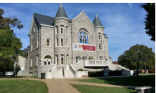
Virginia Union University