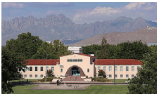
New Mexico State University