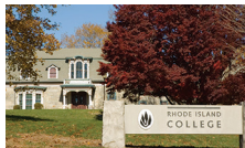
Rhode Island College