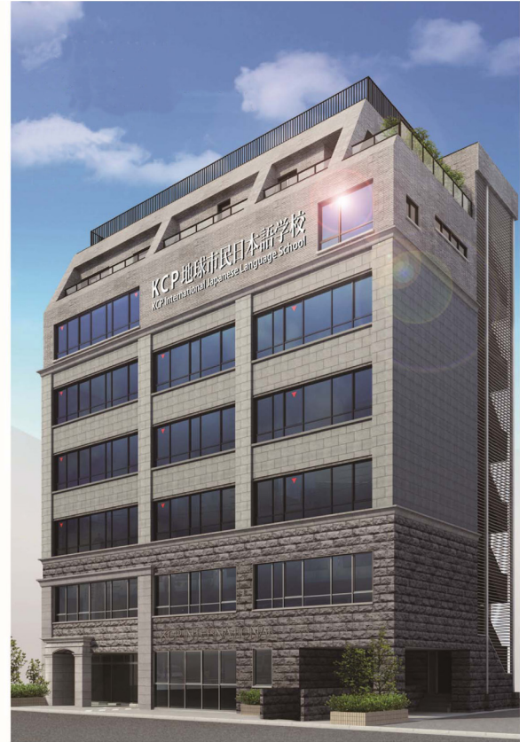
KCP Campus in the heart of Tokyo