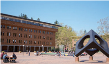
Western Washington University

These universities grant academic credit to students enrolled at them and can also grant transfer academic credit to students from other colleges who apply to the KCP program through them.