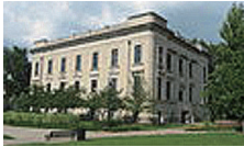
Indiana State University