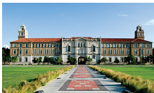
Texas Tech University