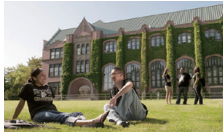
University of Idaho