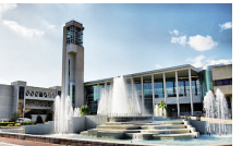
Missouri State University